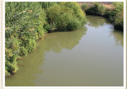
Jordan River North of Sea of Galilee

The highest point in Israel is Mount Hermon, which is 9,232 feet in elevation. Jerusalem is 2,680 feet above sea level. Just 10 miles from Jerusalem is the lowest piece of land on Earth, the shore of the Dead Sea, which is 1,300 feet below sea level.